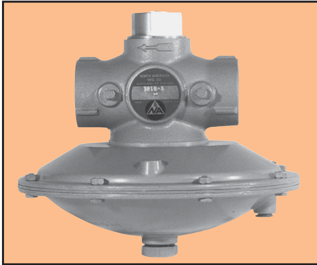
7218 Regulators have soft seat for low flow control.

7218 REGULATORS accurately maintain a constant air/gas ratio over a wide range of firing rates in both nozzle-mix and premix gas burner systems. Molded diaphragms ensure excellent tracking, repeatability, maximum flows, and superior turndown.