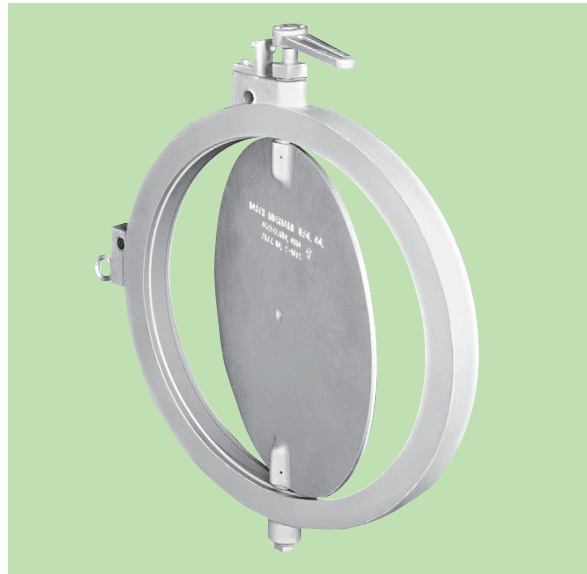
1145 or 1155 Manual Wafer Valve

North American Wafer Butterfly Valves are rugged, lightweight, and used for controlling low pressure air or gas flow. They sandwich between companion flanges with two locating holes on the valve body. All wafer valves have stainless steel shafts; bodies and discs are heat-resistant cast iron. All are suitable for inlet pressures up to 25 psig, provided differential pressures across valves are limited to 1 psi for 1145 and 1146 Valves, 2 psi for all others. No lubrication is required. Seven types are available.